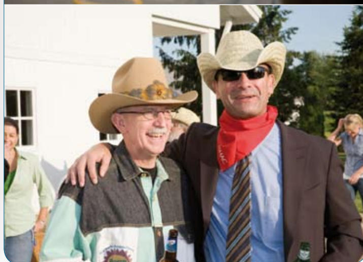
Live Cases (up) – Gala Barbeque Dinner